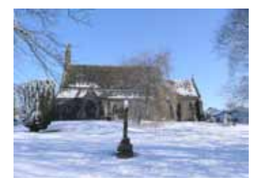
See inside for more pictures of the snow

Re-cycling - more interest in this issue authority wide