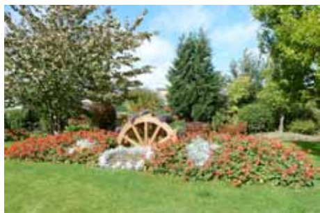
Photo of Village Green from last year, lets hope it looks as good for this year's judging for Morton-in-Bloom

The above, whilst not particularly gripping now, were locally important at the time. Some highlights nationally were the Band Aid single and Torvill and Dean winning gold. It was a year for disasters – the Brighton Bomb and lightening striking York Minster to mention just two. The Thames Barrier opened and it was the Eureka moment for DNA fingerprinting. The most famous person born in 1984 was probably Prince Harry although if football is your thing, you may prefer Glen Johnson!