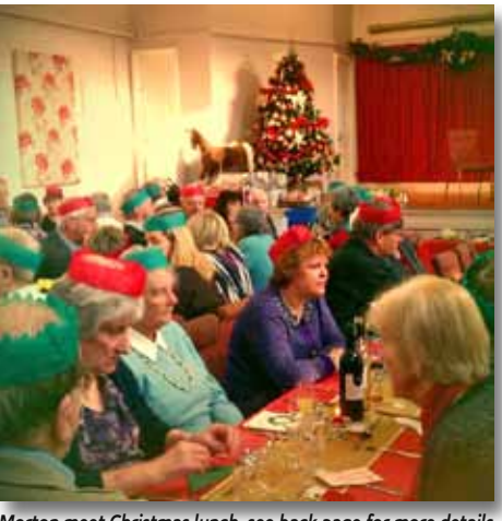
Morton meet Christmas lunch, see back page for more details