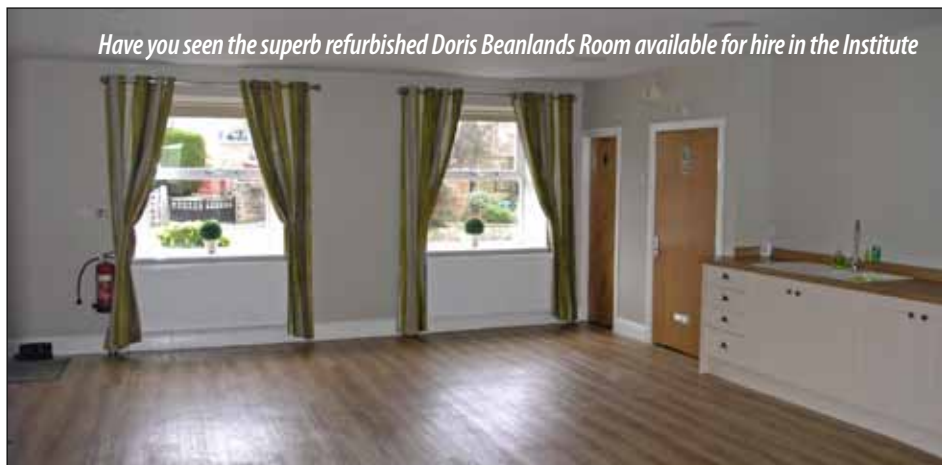
Have you seen the superb refurbished Doris Beanlands Room available for hire in the Institute